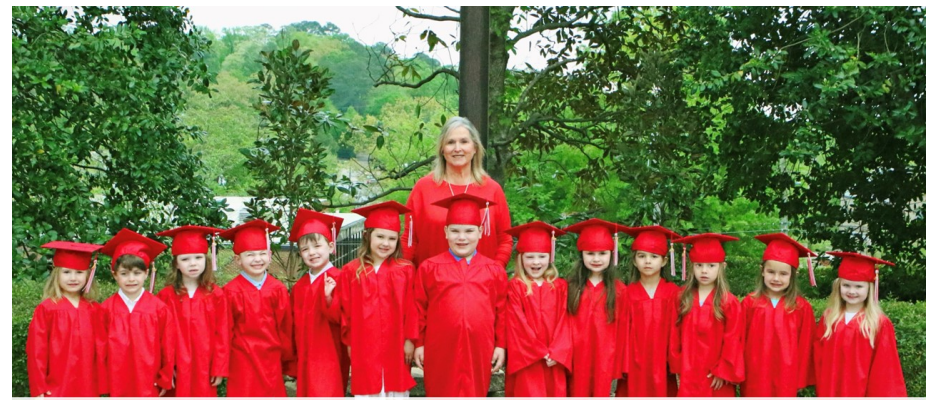
WEEKDAY PRESCHOOL GRADUATES 2024

WE HAVE AN INFANT CARE ROOM AVAILABLE ON THE NORTH SIDE OF THE BUILDING FOR PARENTS WHO NEED TO FEED OR CARE FOR THEIR LITTLE ONES DURING SERVICE